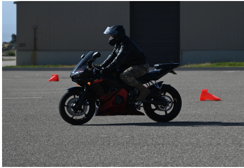
A base member participates in a motorcycle safety training course held on base at Vandenberg Space Force Base, California, April 14, 2023.